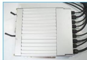
VTC 6110 with optional IP65 enclosure